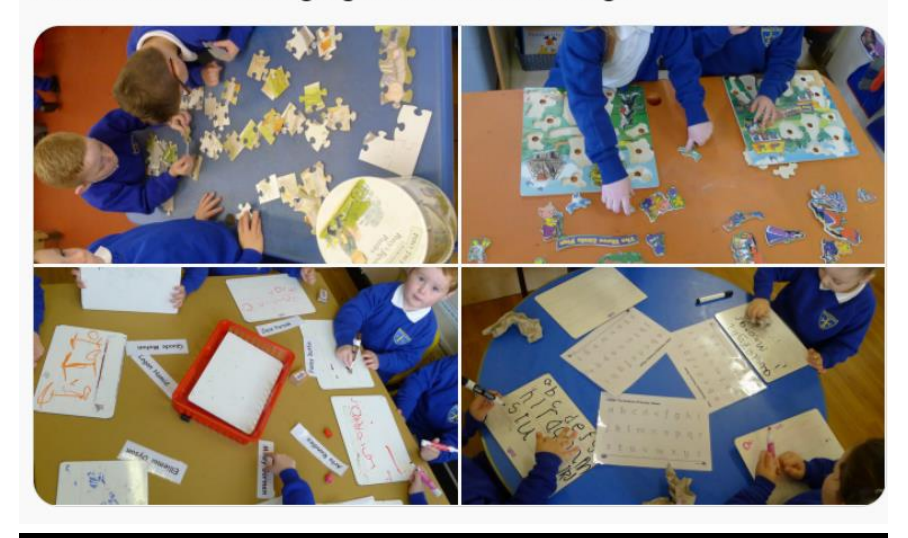
Focused activities during registration

Nursery and Reception Class @ReceptionKCE · 3 Nov 2020 Focused activities during registration in the mornings