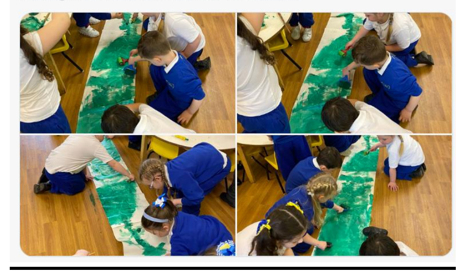
Nursery and Reception Class @ReceptionKCE · 10 Mar 2021···Drawing and colouring a giant from Jack and the beanstalk