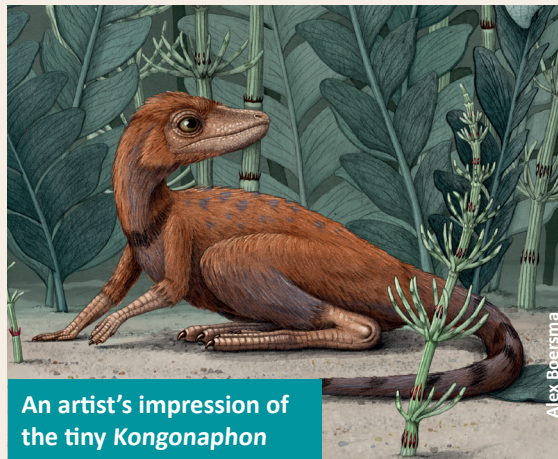
An artist's impression of the tiny Kongonaphon

MEET Kongonaphon, an ancient reptile millions of years older than the dinosaurs.