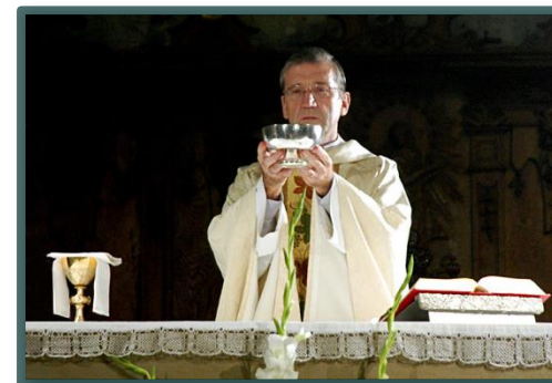
In the Catholic Church, the wine becomes the blood of Jesus.