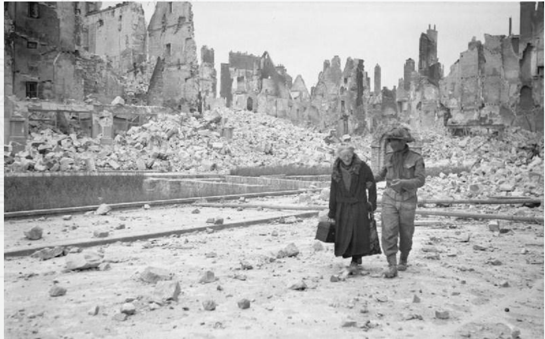
A British soldier helps a French civilian in Caen

The Normandy Landings were a major turning point in the war; there would be further battles still to fight. However, D-Day clearly marked out the beginning of the end of the war.